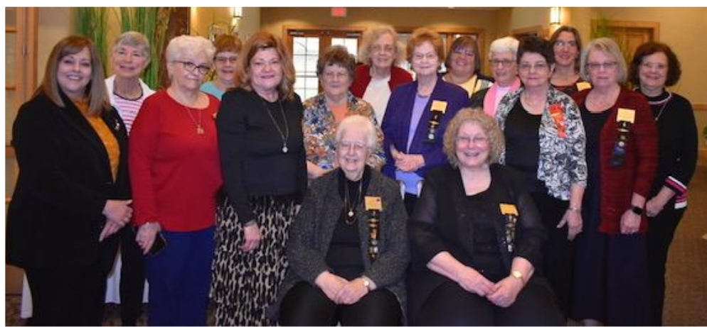
Alpha Beta Past Chapter Presidents are recognized at Alpha Beta’s 75th Birthday Day Celebration.