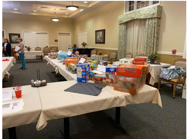
Above: Members helped fill the food closets of six school districts (Bedford, Chestnut Ridge, Claysburg Kimmel, Everett, Tussey Mountain, and Greater Johnstown) with their donations for the fall collection for the schools Weekend Backpack Program.